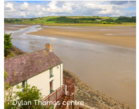
Dylan Thomas Centre