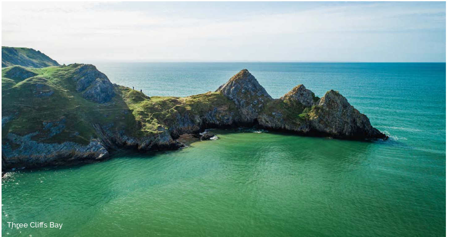
Three Cliffs Bay