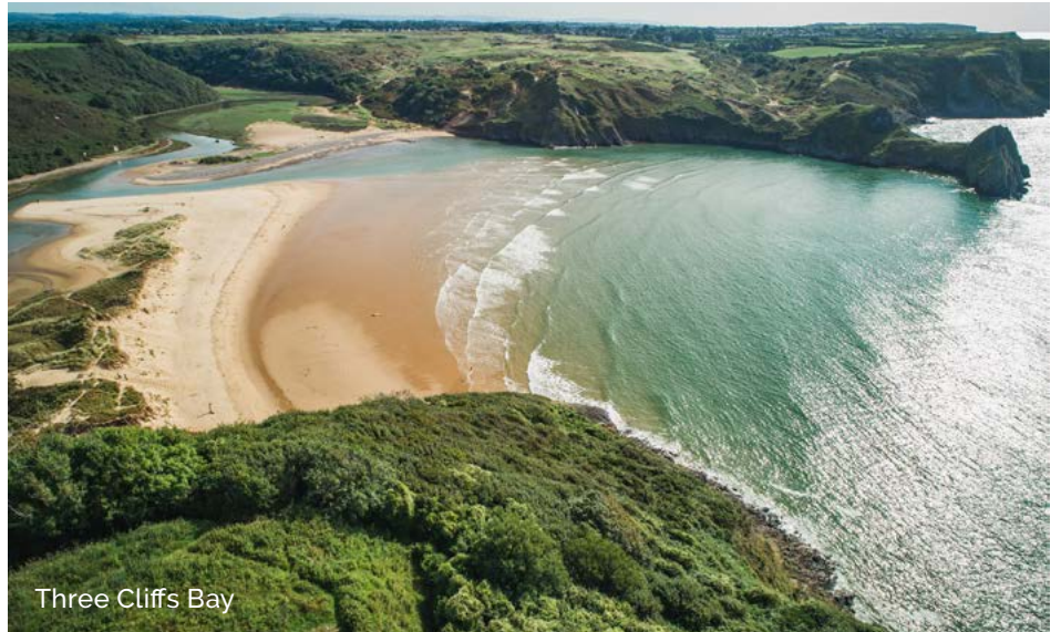
Three Cliffs Bay